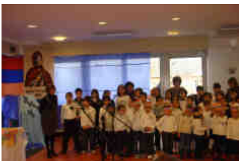
Վարդանանց տօնին նկիրած հանդես