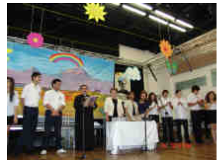
2010 ամաւերջի հանդես