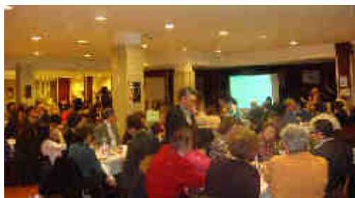
Ընդհանուր գիտելիքների մրցույթ