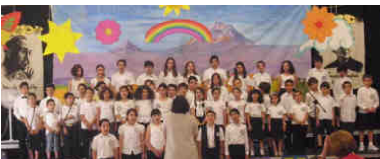
2010 ամաւերջի հանդես