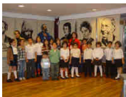
Մշակույթի օրւան նկիրած հանդես