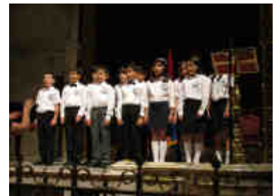
Վարժարանի երգչախմբի ելույթը